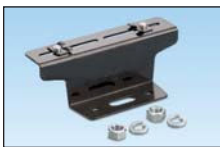
FR6CS12 FR6CS58 FR6CS12M FR6CS58M